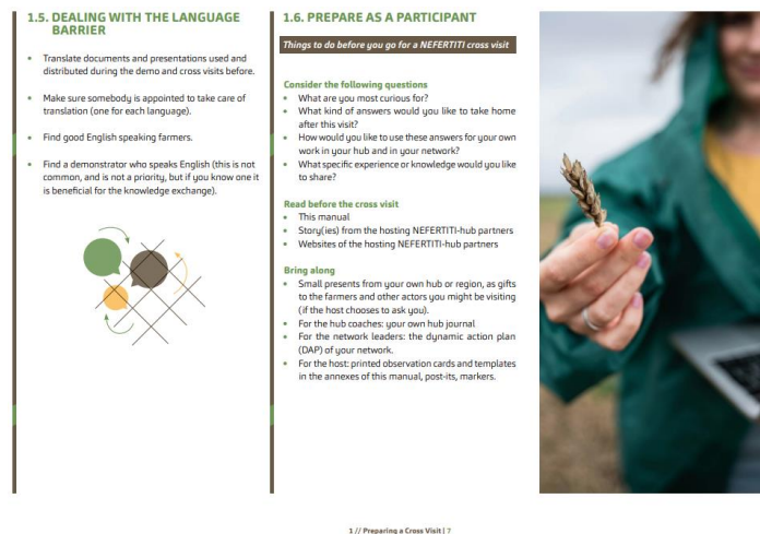
Figure 4. Nefertiti online guidelines