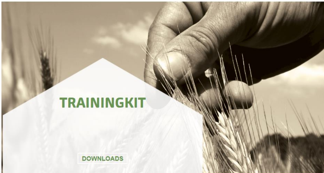
Figure 1. Farm demo toolkit

The planning and performance of demos and cross-visits will be based on the methodologies developed in the FarmDemo (AgriDemo-F2F, PLAID and NEFERTITI collaboration) training kit ( https://trainingkit.farmdemo.eu/ ) which collects tools, guidelines and videos to organise farm demos. Furthermore we use the experience from projects like i2 connect and FAIRshare.